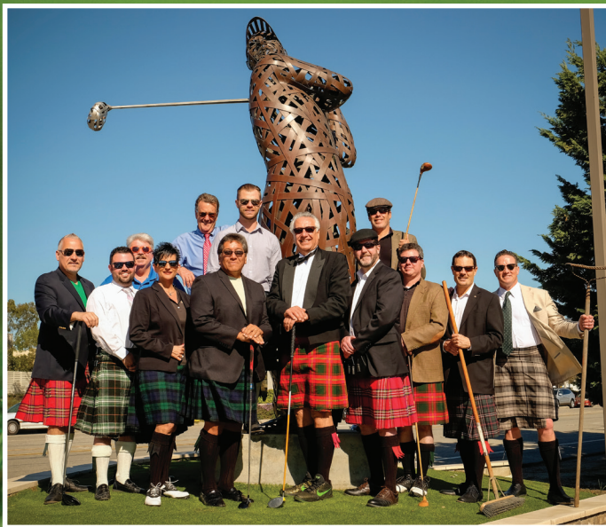
The Wild and Wonderful 2017 committee members went "all in" for the annual photo.